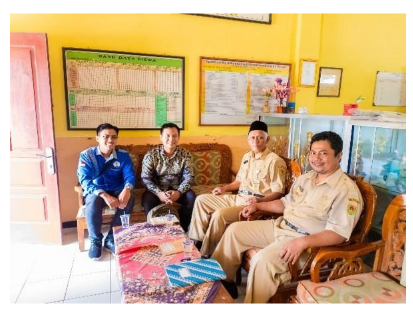
Figure 2. Coordination with the Principal of SDN Mandusari