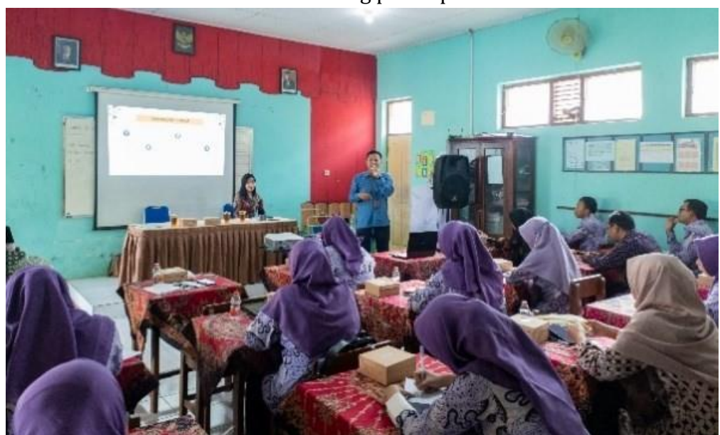
Figure 4. Implementation of Material Delivery

In the material delivery activity depicted in Figure 4, the participants were given a conceptual understanding starting with an introduction to the curriculum regarding the diversity of students and mapping the needs of students. This is following Rahmawati et al., (2023) that training can begin with an introduction to the curriculum, the diversity of students, and the mapping of students. In addition, participants were also explained differentiated learning strategies in each aspect. Training materials can include the definition of differentiated instruction, as well as the application of differentiated instruction (Muqtada et al., 2024). This activity involved the entire PKM team and training participants.