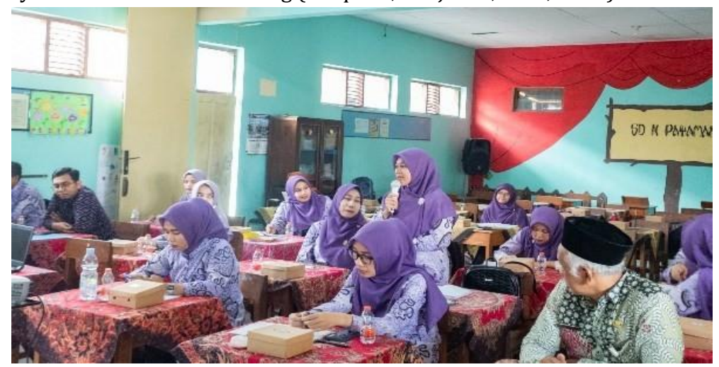
Figure 5. Implementation of Discussion by Participants

assignment given. The provision of these options aims to facilitate students in learning (Krisma et al., 2024) so that it is by what is expected by Ki Hajar Dewantara, namely free and Merdeka learning (Muqtada, Nurjanah, et al., 2023).