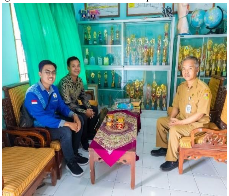
Figure 3. Coordination with the Principal of SDN Payaman 1