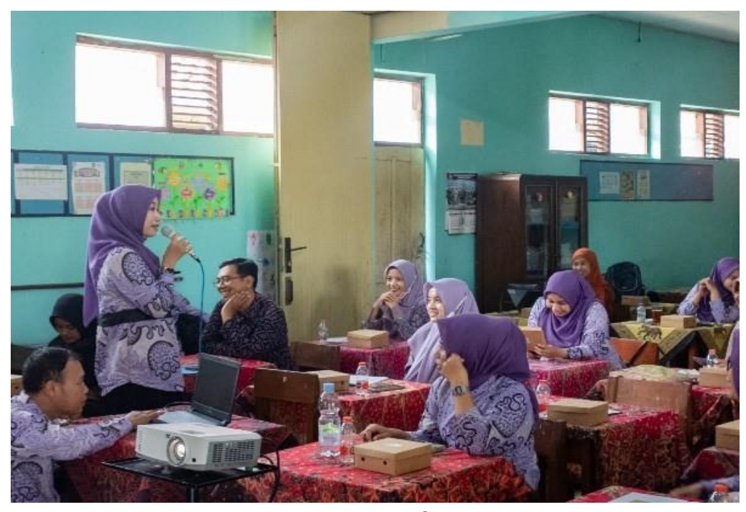
Figure 6. Practice Implementation