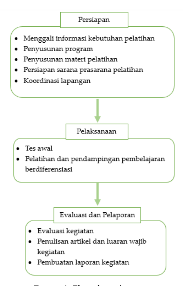
Figure 1. Flowchart Activity