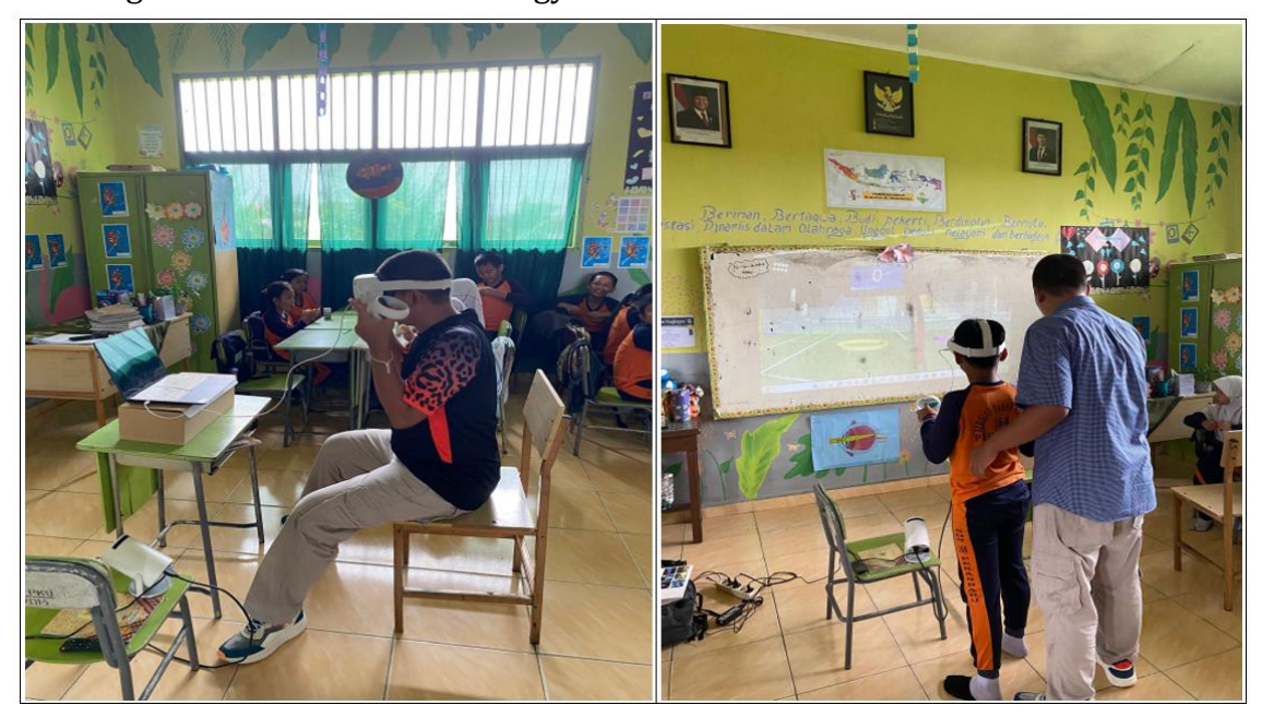
Figure 3. Introduction and Practice of Using VR

The practical sessions took place in an enthusiastic atmosphere, with students showing a high interest in trying and learning new techniques. The use of VR provides a very different experience from traditional methods, with a visual feedback feature that helps students correct movement errors in real time. The realistic simulation allows them to better understand hand position, punch angle, and reaction time. In addition, these technology-based activities also facilitate more collaborative learning, where students share experiences with each other and comment on their peers' skills. Teachers involved in this activity noted an increase in student engagement and motivation towards badminton lessons, which were previously considered boring by most participants. Thus, this activity successfully introduces a more interesting and innovative learning approach, opening up new opportunities to improve the quality of sports education through the integration of modern technology.