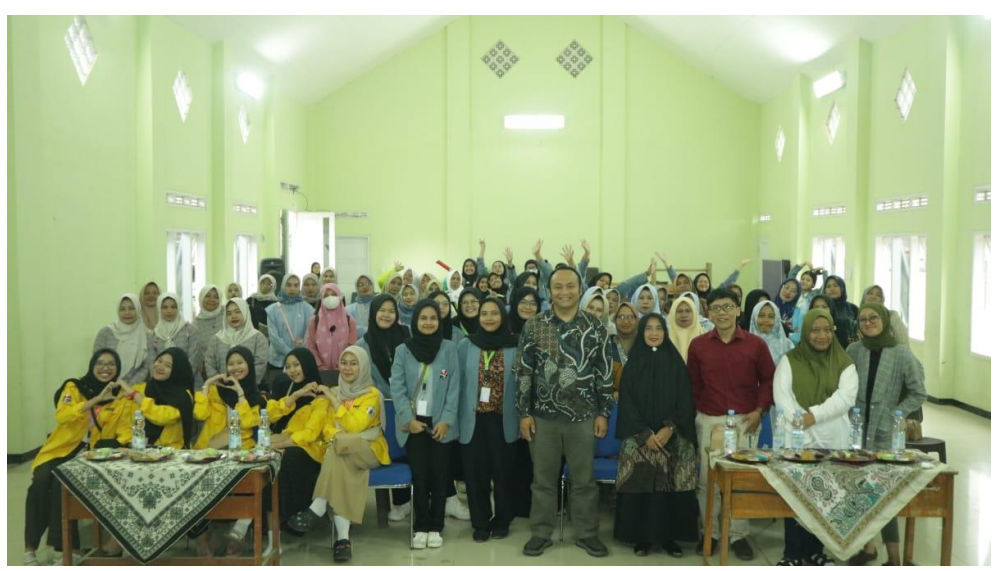
Figure 2. Stunting Prevention Seminar Activities

Both hope that a similar workshop can be held again, with additional topics such as how to effectively process vegetables so that children like them, considering that many children in the Pangalengan area find it difficult to eat vegetables even though this community is a vegetable producer. In addition, the first speaker emphasized the importance of expanding this education to reach more people, especially because of the high rate of early marriage in Pangalengan. Further education is expected to increase public understanding of the importance of parenting in preventing stunting and creating a healthier generation in the future.