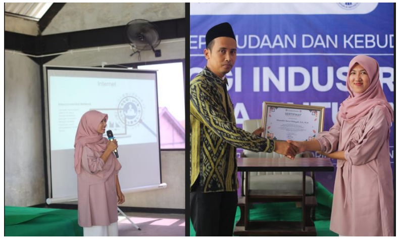
© 2023 by the authors. This work is licensed under a Creative Commons Attribution-ShareAlike 4.0 International License.

Customer/Community Relations: Social media facilitates direct communication between institutions and their audience, allowing for real-time engagement and feedback. Addressing concerns promptly and transparently can strengthen trust and build a positive reputation. Recruitment and Talent Acquisition: Institutions can use social media to attract top talent by showcasing their culture, values, and opportunities. Engaging content highlighting employee experiences can be influential in attracting skilled individuals. In conclusion, leveraging social media for self and institutional branding offers avenues for visibility, networking, credibility, and relationship-building. When used strategically and authentically, it can significantly enhance both personal and institutional reputations, fostering growth and opportunities.