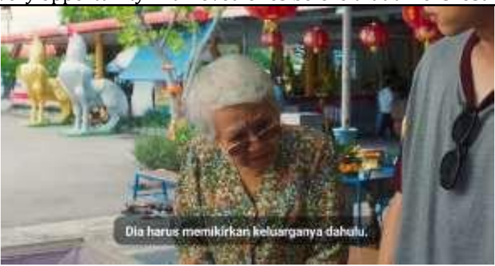
Figure 3. Scene Seconds 01:00:59-01:01:37

who showed that M's presence was considered important by her family. The message of this film reminds us that moments of togetherness with family are priceless. Make time for our family while they are still around, because that is what will give them deep happiness and satisfaction. From this, we can take the message that we often neglect precious moments with our loved ones, perhaps because of busyness or lack of awareness of the importance of time spent together. Physical presence at family events or moments of togetherness reflects a sense of respect, love, and care that cannot be measured by material things. So, we must learn to appreciate every opportunity with loved ones before that time is lost or too late.