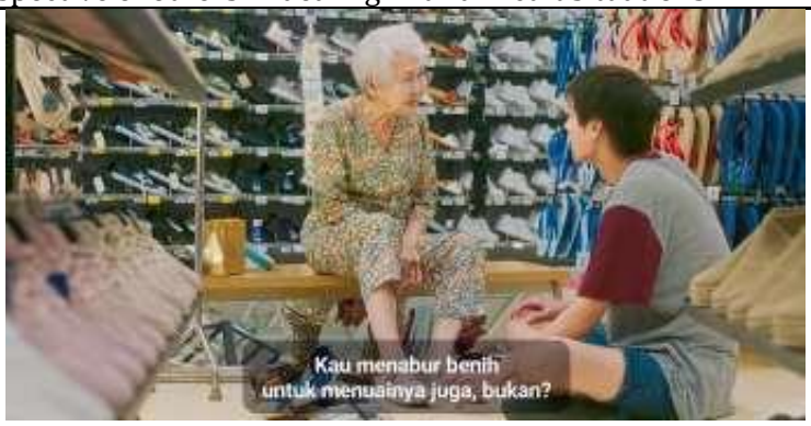
Figure 4. Scene Seconds 01:03:47-01:04:01

important message that genuine care and compassion have a higher intrinsic value compared to financial motivation. It teaches that sincere care and empathy for those closest to you are worth more than material gain, and that loving relationships are the key to true happiness. The moral message is that in life, responsibility to the family should sometimes be prioritized, but that does not mean neglecting other family members. It teaches about the balance between maintaining responsibility for the nuclear family and still caring for the extended family, as well as the importance of understanding the perspective of others in dealing with difficult situations.