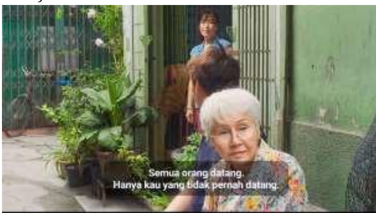
Figure 2. 31:39-32:33 Seconds Scene in the Movie Table 1. Seconds 31:39-32:33 in Movie

interpretation is a moral message of perseverance and courage. While in How to Make Millions Before Grandma Dies, the sign is the desire of the grandchildren to pursue an inheritance, the object is the spiritual journey of the family, and the interpretation is the importance of love and family relationships over material wealth. Both films teach moral values that are deeper than just material things (Kartini et al., 2022).