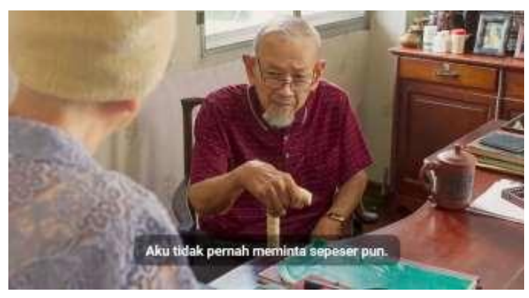
Figure 7. Scene Seconds 01:19:14-01:21:21

Table 6. Scene Seconds 01:19:14-01:21:21