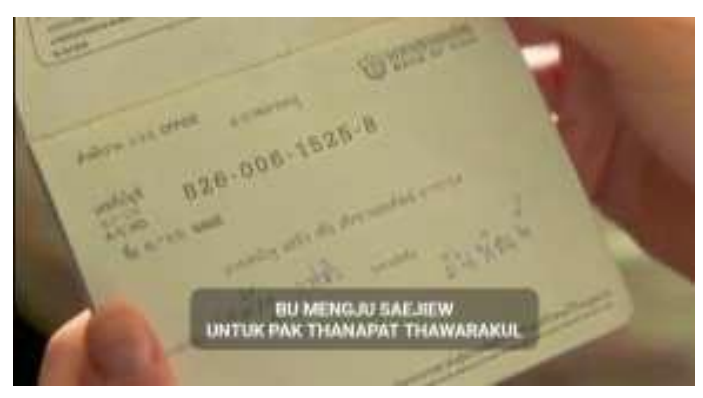
Figure 11. Scene Seconds 01:52:43-01:54:14