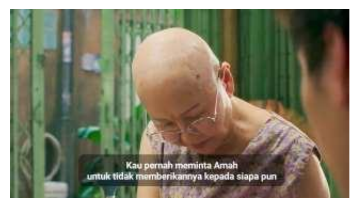
Figure 6. Scene Seconds 01:17:16-01:17:53