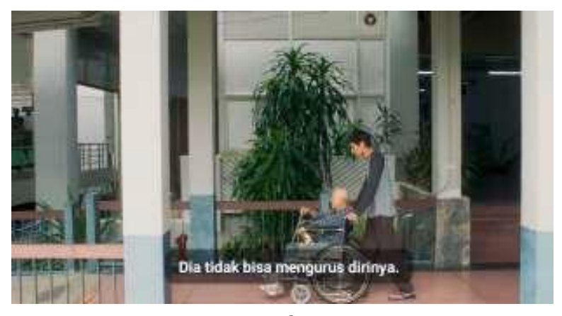
Figure 9. Scene Seconds 01:30:33-01:32:02

Table 8. Scene Seconds 01:30:33-01:32:02