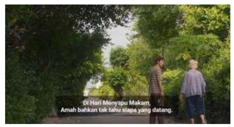
Figure 8. Scene Seconds 01:23:05-01:23:42