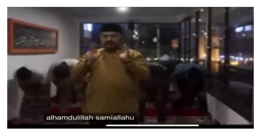
Figure 5. Congregational Prayer Scene with Family at Café Gus Biru Table 4. Semiotic Analysis of the Congregational Prayer Scene with Family at Café Gus Biru